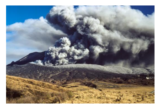
Mount Aso explosive eruption in 2014

IAEG Japan National Group intends to hold an international workshop co-sponsored by IAEG and ISRM. ISRM held four international workshops of rock mechanics in volcanic areas from Portugal, 2002 to Italy, 2015. In these days volcanic phenomena are important from several aspects. This workshop will be held in 2020 or 2021 at Fukuoka University of two days discussion and two days field excursion in a large and active volcano Aso area in middle Kyushu.