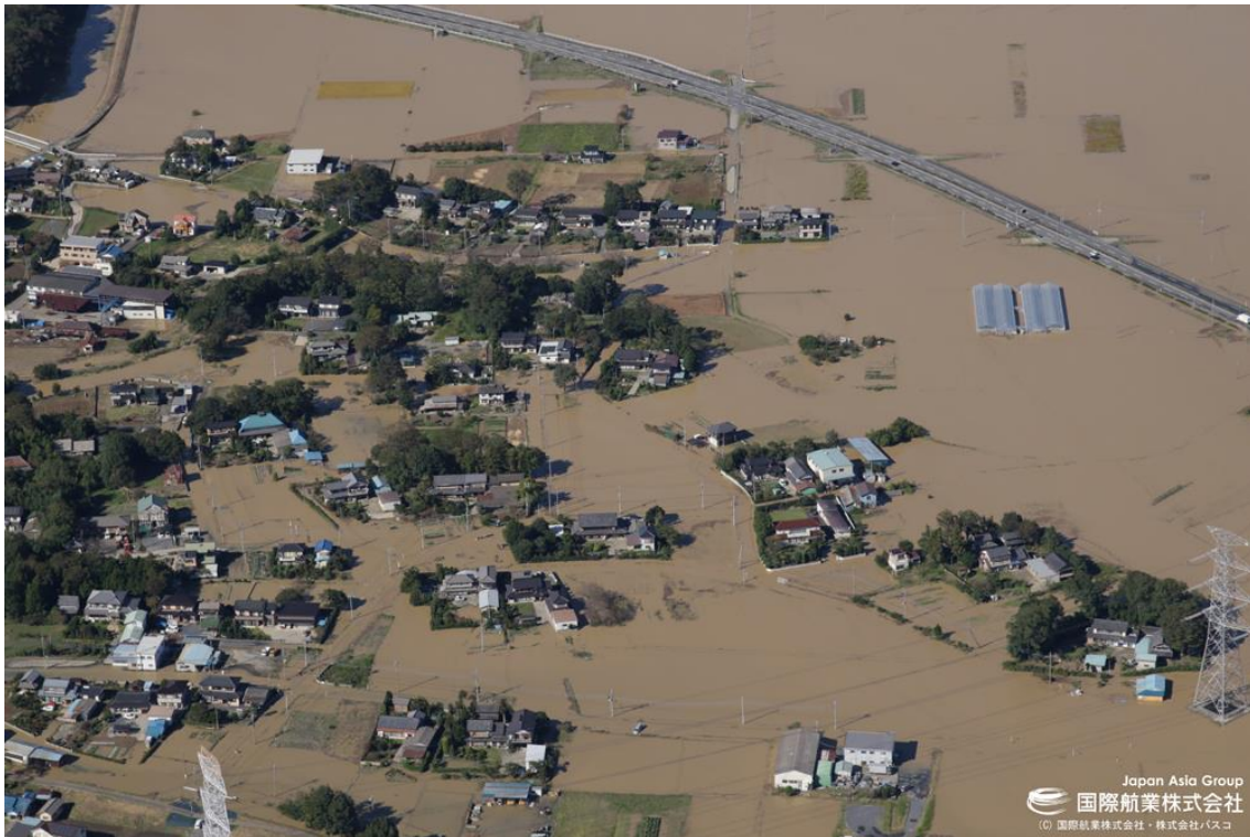
Flood disaster induced by typhoon 19th in October