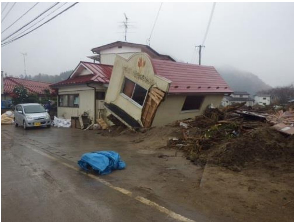
Damaged building by debris flow at Marumori-machi, Miyagi pref.