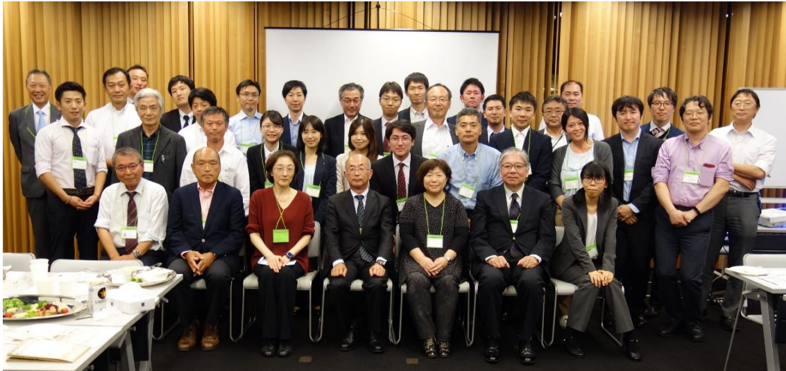
Free meeting for activation and recruit of young members and women's members

Engineering geologists of the JSEG women's members had free meeting with other members. Main theme was "Activation and recruit of young members and women's members". This task is very important for our JSEG as sustainable society in future generation.