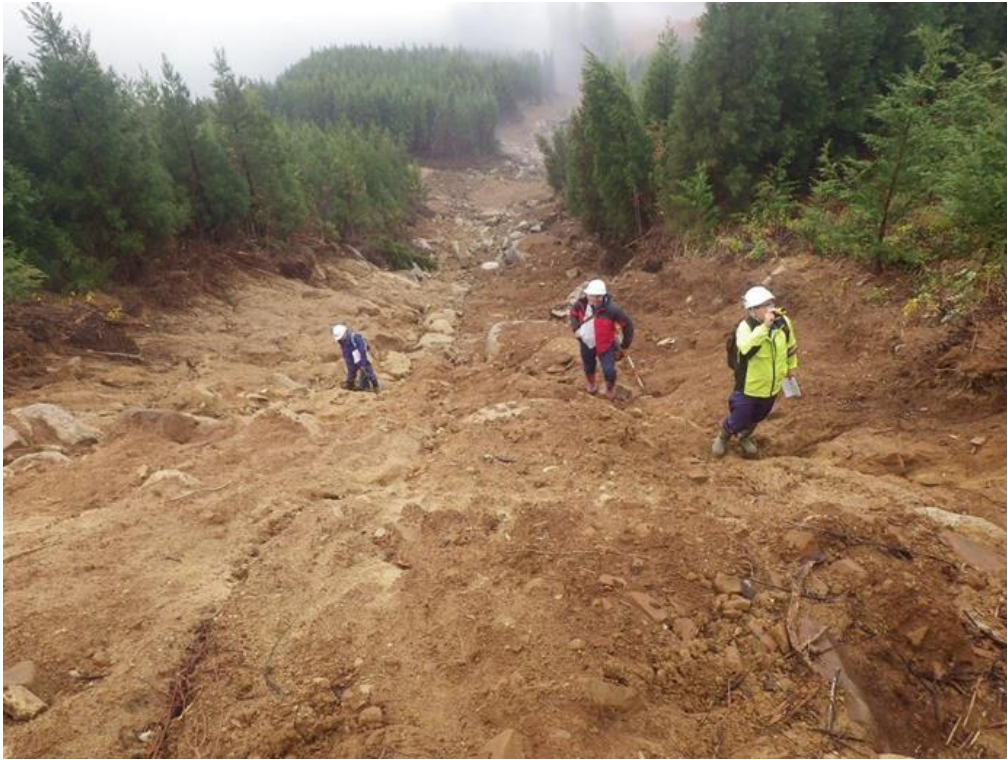
Investigation on collapsed slope at Marumori-machi, Miyagi pref.