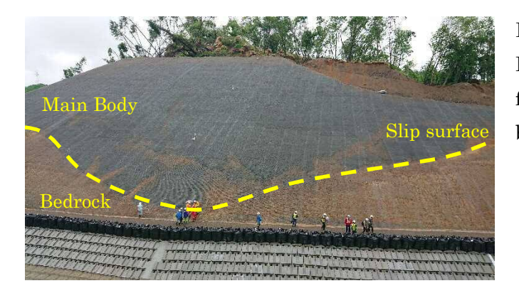
Photo: Cut slope of landslide toe. Landslide was moved 350m from the back towards the front by the earthquake.