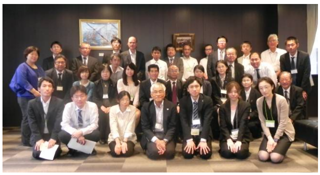
Free meeting for activation and recruit of young members and women's members

Engineering geologists of the JSEG women's members had free meeting with other members. Main theme was "Activation and recruit of young members and women's members". This task is very important for our JSEG as sustainable society in future generation.